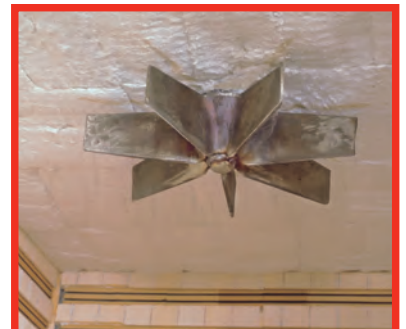
High temperature 18" fan