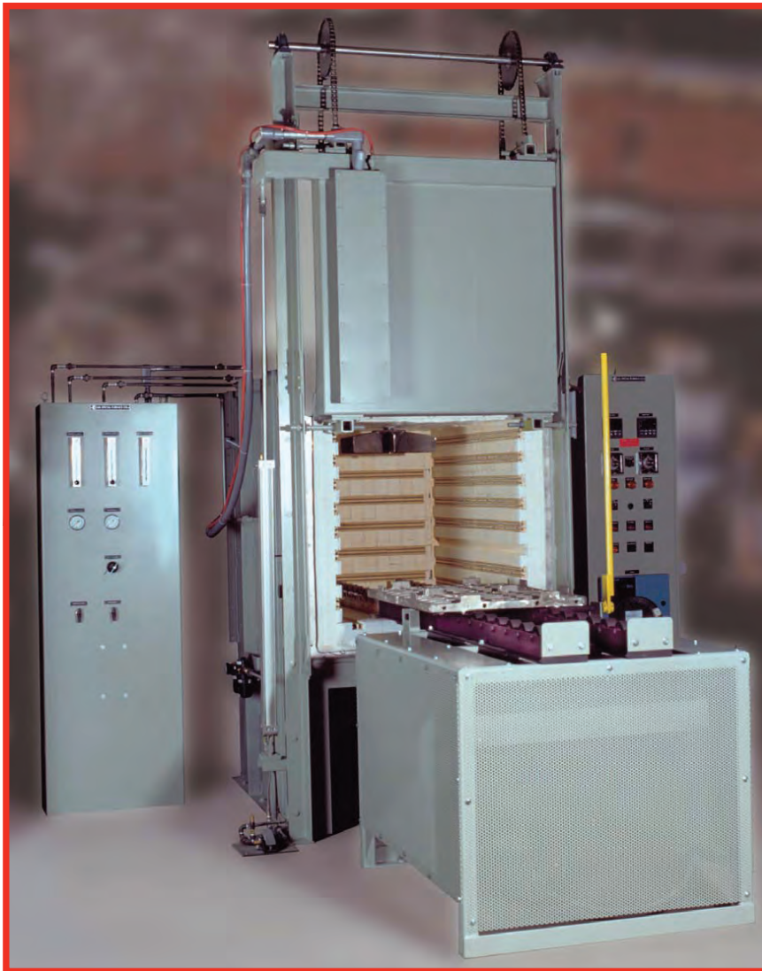
XLE 814 with pneumatic vertical door