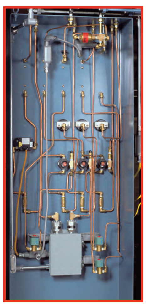
Detail of hydrogen piping