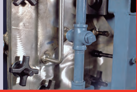
Detail of exit pipe with clean out and the quick release clamps.