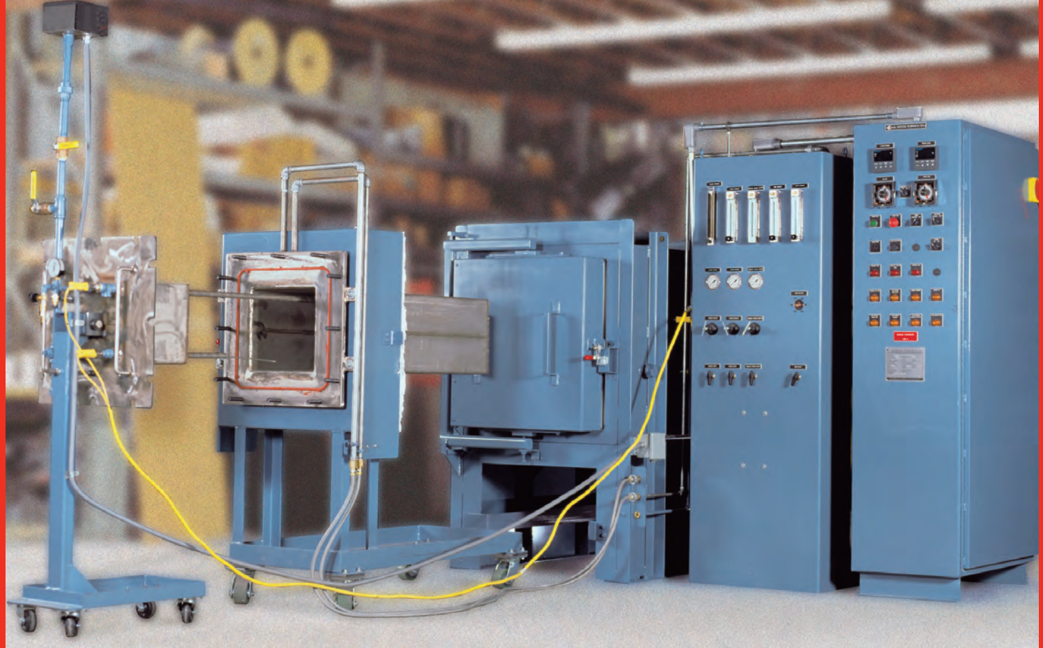
Model XLC 824 with removable retort option