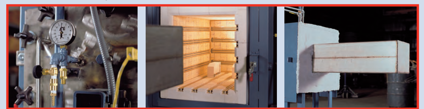
Retort pressure gauge & test bib