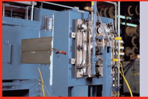
Detail of removable retort plug.

This is an XLC 824 with a retort fixed in the furnace and a cooling venturi. The cart that holds the plug door is similar to the XLC furnaces with removable retorts. This system has an inert atmosphere control. Notice the red silicone "0" ring retort seal. Gas and thermocouple connections on a fixed retort are on the rear rather than in the door plug.