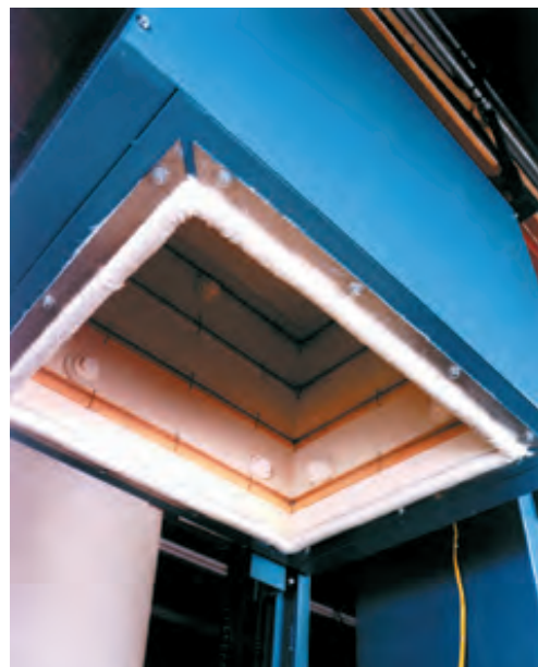
This shows the inside of a WQ2