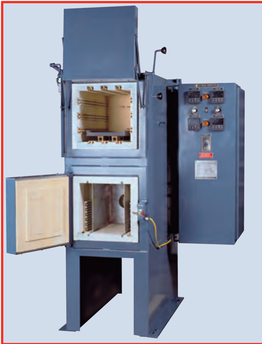
Model QDS 124