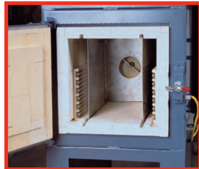
Inside of Tempering Oven